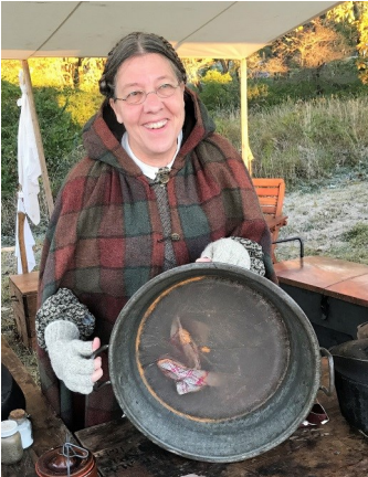
Forgetting to empty the dish water was not a good idea when it was this cold!