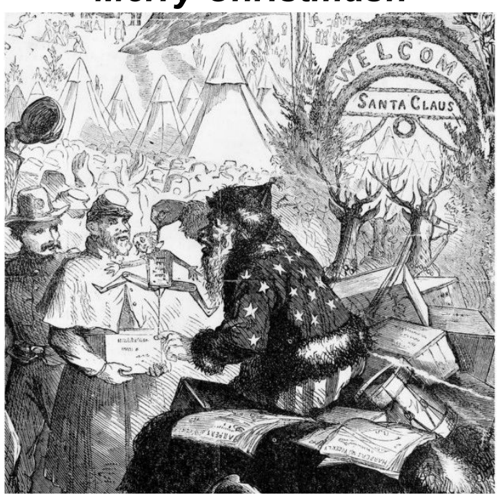
Thomas Nast drawing of Santa visiting a Union Camp in 1863.